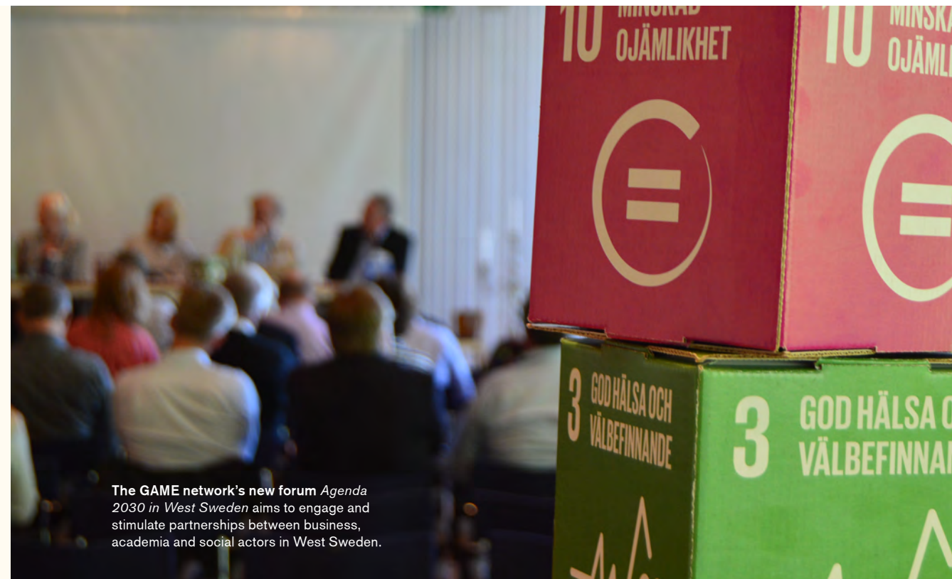
The GAME network's new forum Agenda 2030 in West Sweden aims to engage and stimulate partnerships between business, academia and social actors in West Sweden.

SDSN Youth in Northern Europe has 30 member organisations.