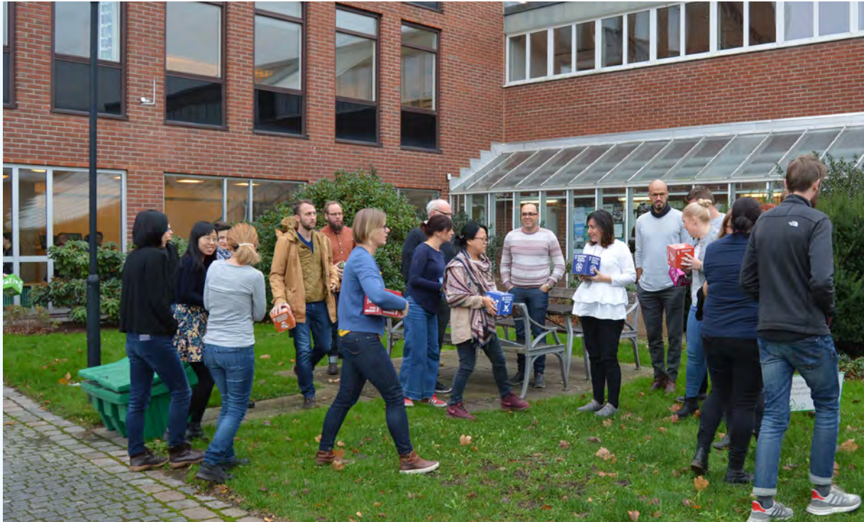
Doctoral students from various disciplines and different universities in Sweden participated in the interdisciplinary PhD course Sustainability Opportunities – Exploring Sustainability at the Cross-roads of Science and Society .